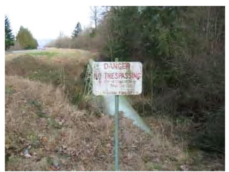
Danger lurks along the Trail of Tears

A trail to no where, a systematic taking of private property owners one by one. King County attorneys appear to be doing the "visiting" outside the city limits.