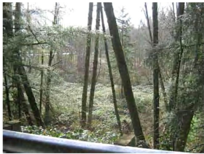
Trails over swamps, trails over Mud Mountain road

Trails thru wetlands, trails thru aqueducts, trails thru natural gas, trails of fools. Rural land owners cannot do anything with their buildings or land, at the same time they are forced to pay unconstitutional property taxes and have their wages and land stolen while the state, county and city government corporations build trail over swamps and rivers.