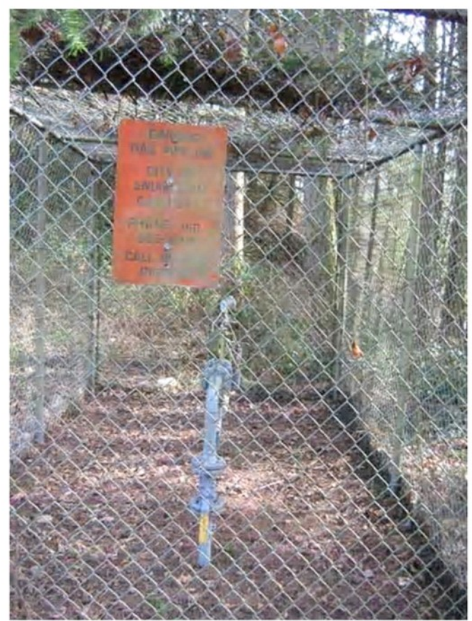
Trails to Cages better used for internment of the complicit government fools who come up with this nonsense.